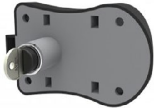
Lock for non-metal lockers