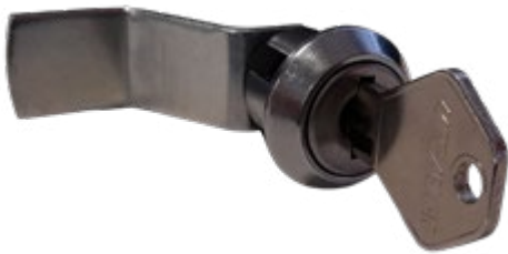
Lock for metal lockers