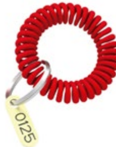
Numbered elastic bracelet

Colours to choose from: blue, grey or red